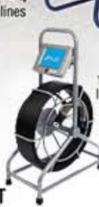
11 E-CAM Inspects 3" - 8" dia. lines