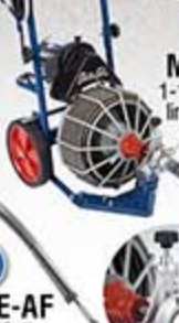
7 Model Z5 1-1/4" - 3" dia. lines up to 100'