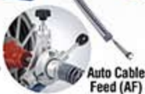
Auto Cable Feed (AF)